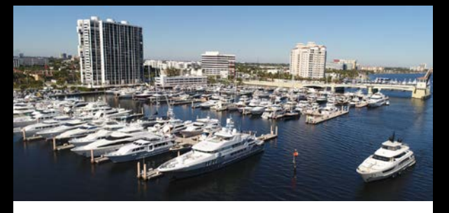
Palm Harbor Marina

"Madgig Networks performed a superior upgrade of our Marina WiFi system and corrected many of the issues we had with our prior install before Madgig."