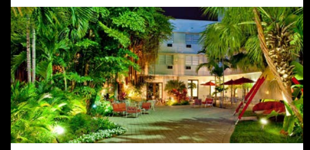
The Dorchester South Beach

"The reliability of the wireless infrastructure we've received is extraordinary."